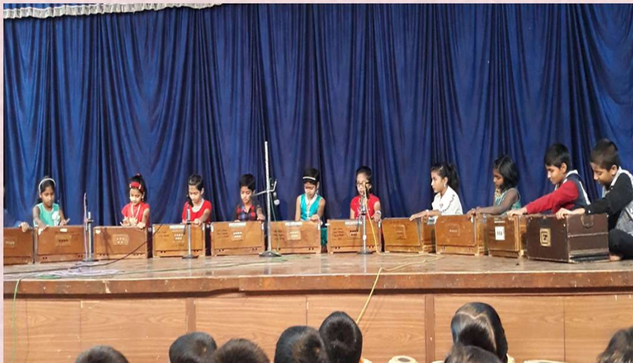
TABLA , FLUTE AND HARMONIUM PRESENTATION